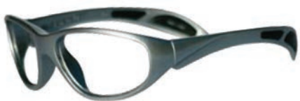
ITEM: LT100 Ultralite

All glasses are made with the highest quality SCHOTT glass and offer .75mm lead equivalency. Most styles are available in Single, Bifocal, and Progressive prescriptions.