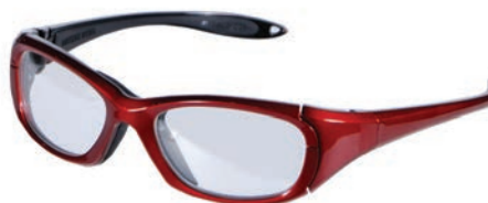
ITEM: LT500 Maxi

Manufactured of lightweight nylon and designed to provide protection for the entire eye area. The curved front and temple bar with rubber tips allow for a close secure fit. Available in Black, Silver, Red, and Carbon Gray. Weight: 58 grams