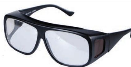
ITEM: LT400 Fitover

These frames are constructed of optical steel base metal electroplate. Each pair is made with an adjustable non-slip silicone nose pad for maximum comfort. Weight: 62 grams