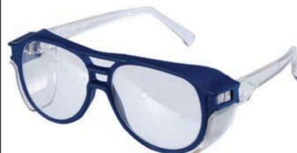
ITEM: LT200 Euro

The Maxi is slightly smaller than the Ultralite and includes a soft rubber nose bridge for increased comfort. Available in Black, Silver, Red, and Navy. Weight: 63 grams