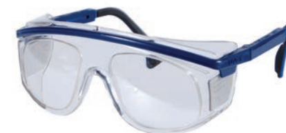
ITEM: LT300 Astro

A standard safety frame which offers excellent protection and large viewing area. Universal form fit bridge. Weight: 75 grams