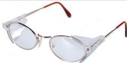
ITEM: LT600 MetalFlex

A lightweight, wrap-around nylon frame with built-in adjustable nose piece to distribute weight evenly over the nose. The earpieces are attached by spring hinges designed to withstand the rigors of hospital use. Weight: 85 grams