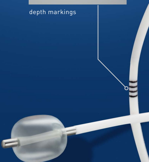
flow directed bipolar pacing catheter