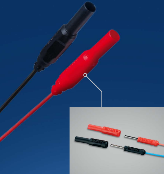
shrouded or unshrouded connectors